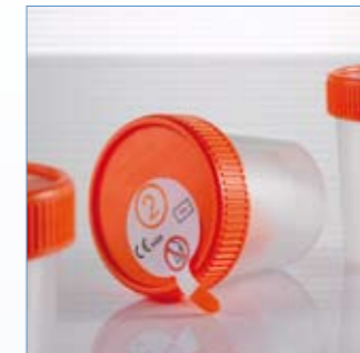
2 Saliva collection beaker 2