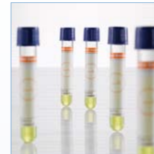
1 Saliva extraction solution, tube 1