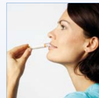
1 Simple saliva collection by thoroughly rinsing out the oral cavity (2 min.); contains yellow internal standard for determination of the saliva quantity.