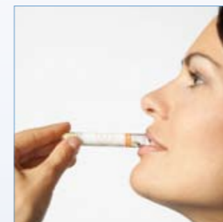
0 Optional to cleanse oral cavity; then spit out rinsing solution.