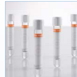
0 Mouth rinsing solution, tube 0