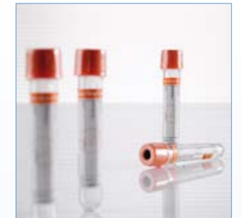
3 2x saliva transfer tubes 3