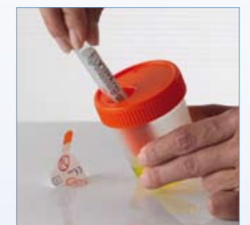
3 Due to the vacuum in the tube, transfer is quick and hygienic. The saliva is furthermore stabilised and preserved.